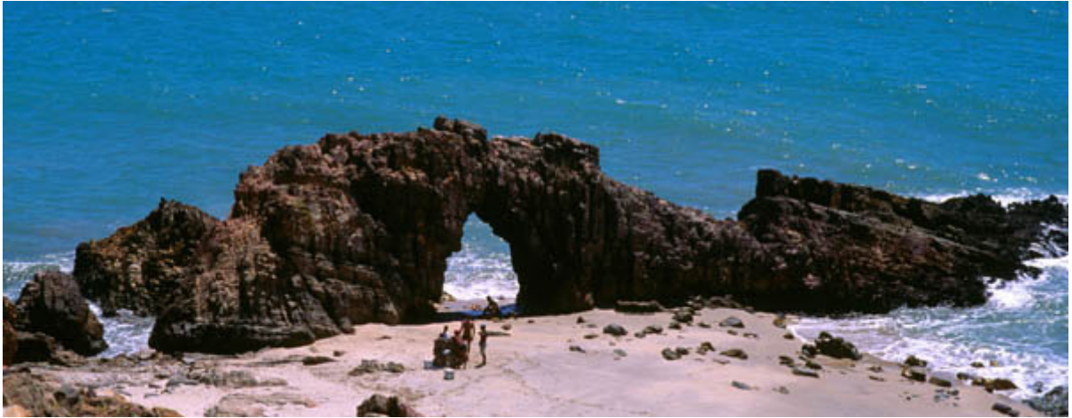
Figure 2 Jericoacoara located a few kilometres from the CAMOCIM development