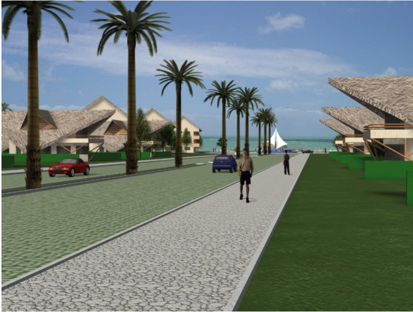
Figure 3 Artist impression: Main road inside CAMOCIM development