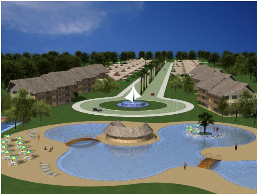
Figure 1 Architect Illustration of the CAMOCIM development