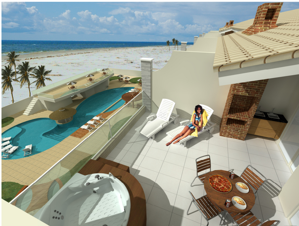
Views from the penthouse